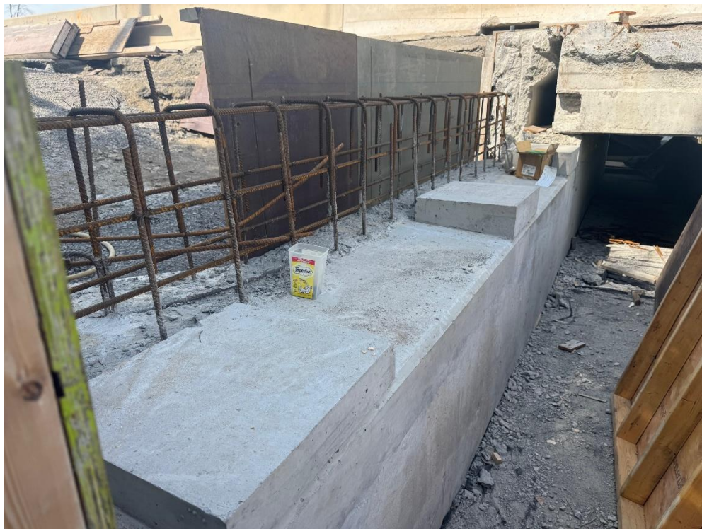
Newly Reconstructed Abutment Top and Bearing Pedestals