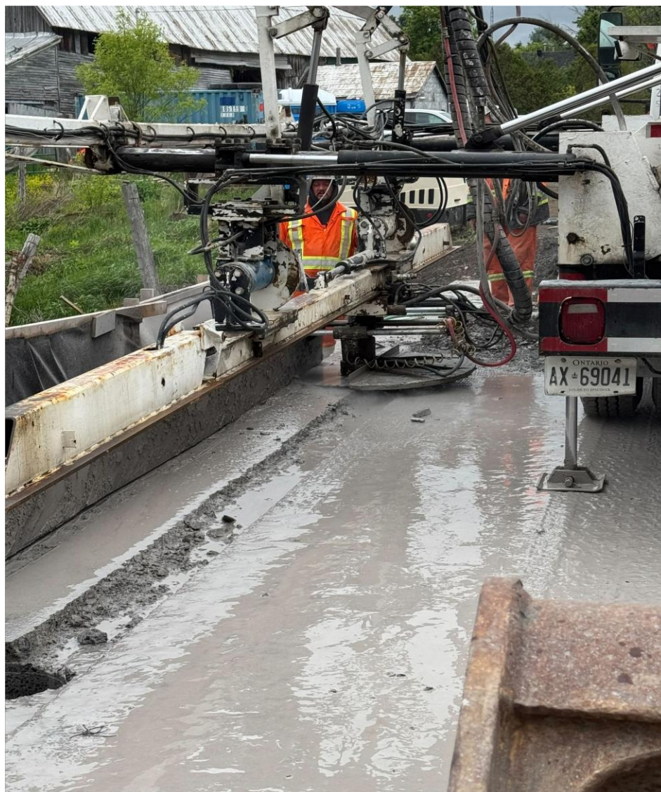
Stage 1 – Saw Cutting Removals

To date the contractor has completed all of the stage 1 removals on the rigid frame structure. New reinforcing steel is being installed across the bridge. The new concrete deck overlay is anticipated to be placed between June 9 th to 13 th . Financially this project remains on budget with no significant additional costs to the project.