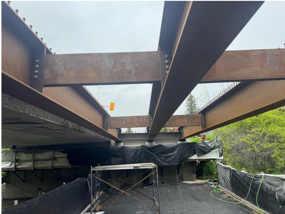
Newly Installed Stage 1 Plate Girders and Diaphragms