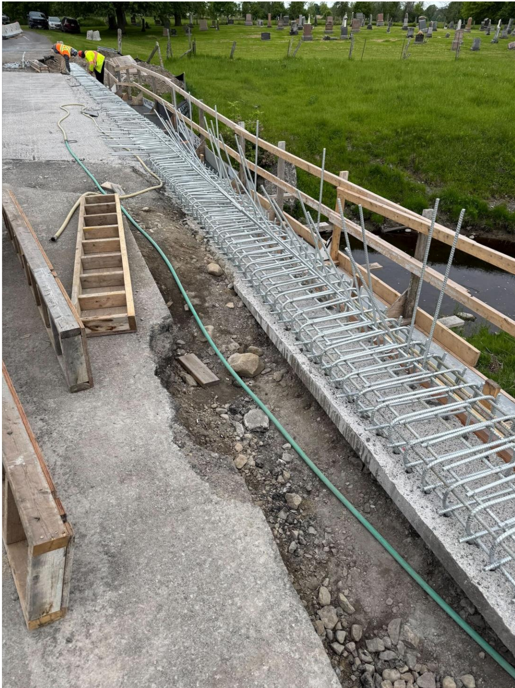
New Galvanized Steel Installation