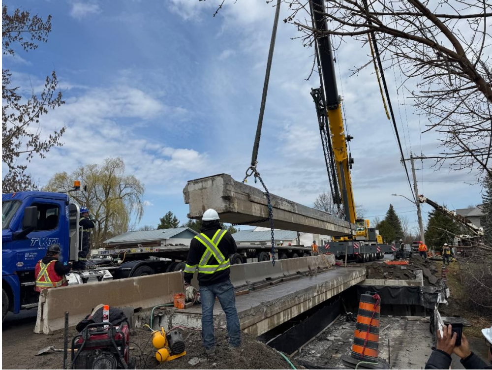
Stage 1 Girder Removal