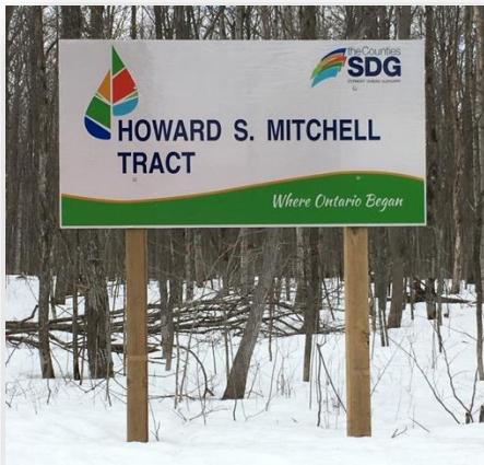
New sign Howard S. Mitchell Tract