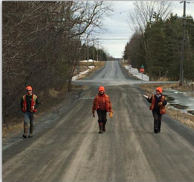
Forestry Staff Social Distancing – North Glengarry

The United Counties of Stormont, Dundas and Glengarry owns land including forests and wetlands. These lands are managed in accordance with an approved forest management plan which provides for sustainable timber harvest that generates revenue, improves forest health, provides wildlife habitat, protects natural heritage, and creates recreational opportunities.