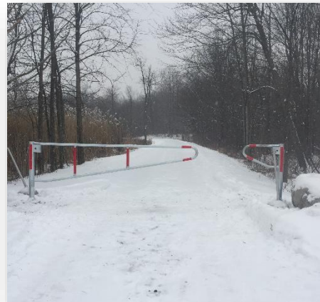
Summerstown Trail Gate